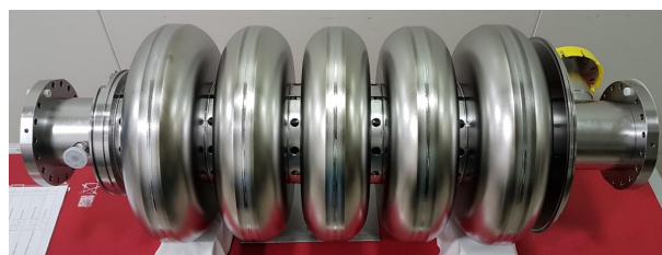
Figure 2: INFN B61_EZ_001 LB650 cavity for PIP-II after final electron-beam welding.

cavity region. In addition, current cryogenic transfer lines setup and liquid helium mass flow availability at the LASA infrastructure only allow for a small temperature time rate across transition, about 1 K/min, therefore the reported residual field could be assumed as completely trapped.