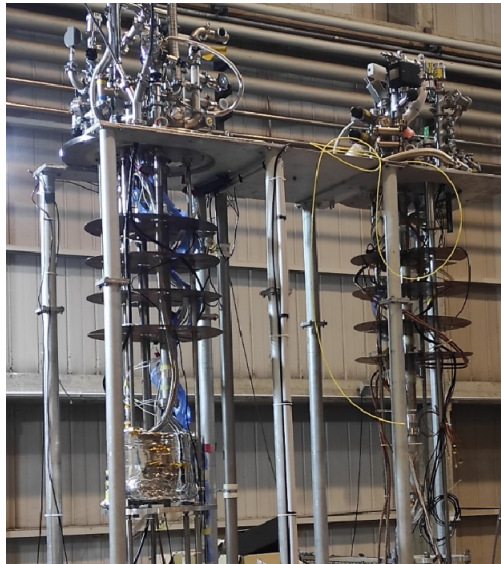
Figure 4: LASA VT inserts. On the left the one in use for PIP-II cavities equipped with tube-in-tube heat-exchanger (wrapped in MLI) and Joule-Thomson refilling system.