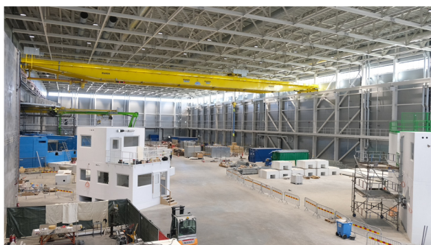
Figure 4: Photo of the South/East experimental hall showing ongoing construction of the ODIN and DREAM experiments (white) as well as the target bunker (blue) housing the choppers.

Instrument construction is ongoing (see Fig. 4), and neutron beam port inserts, neutron guides and beamline shielding is being installed. The bunker housing the choppers and light shutters is also being assembled. The goal is to install all of the in-bunker components before first beam on target.