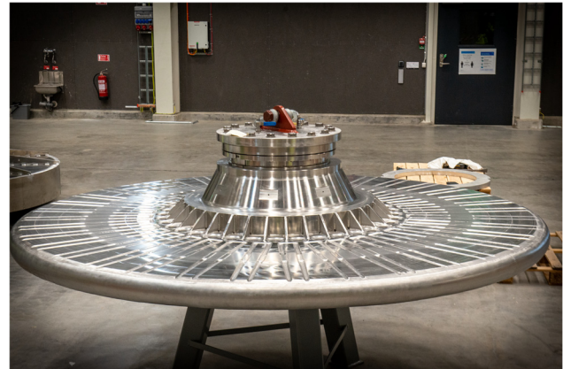
Figure 3: ESS target wheel recently delivered from Bilbao.

In the target monolith, the core vessel has been installed and neutron beam ports welded in place. The vessel that will hold the proton beam window (separating target atmosphere from beam vacuum) has been installed and connected, and the outer shielding has been stacked around and of top of this assembly. Stacking of the inner shielding will begin soon.