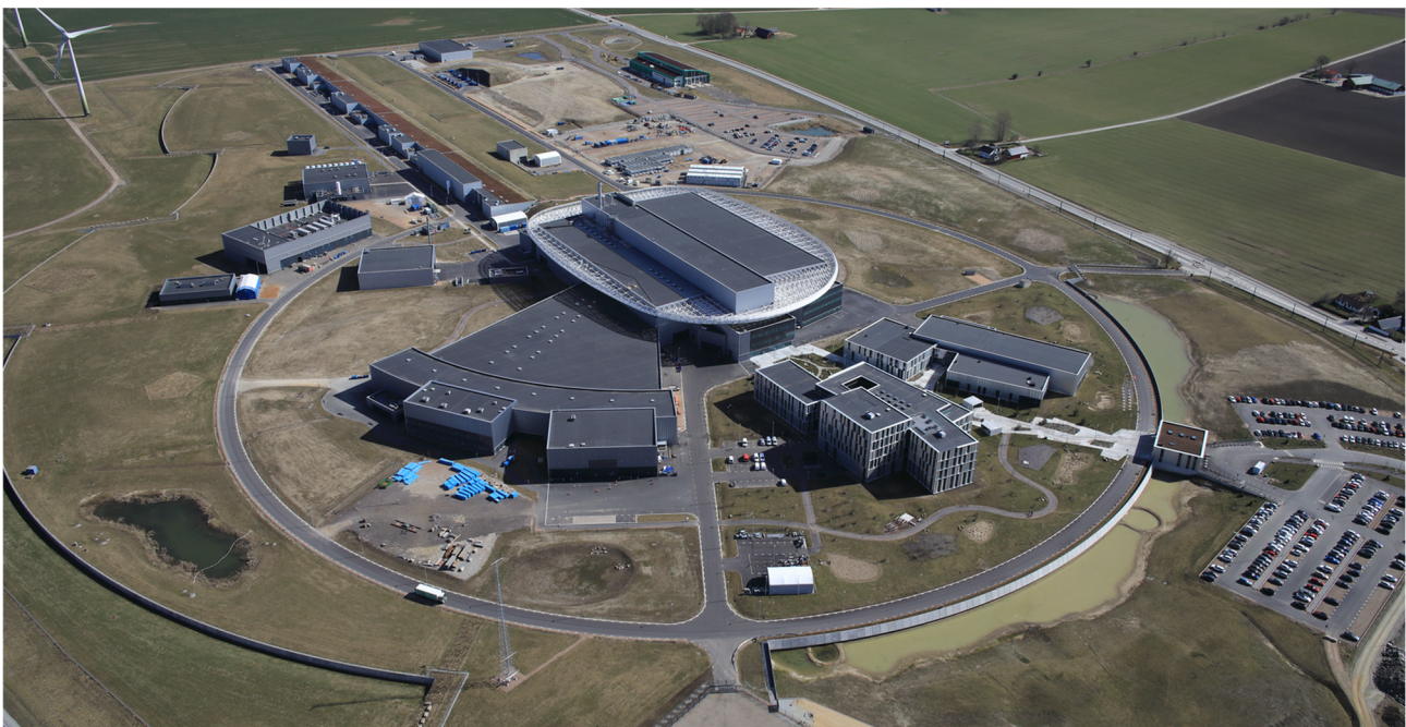
Figure 1: Aerial photograph of European Spallation Source Site, taken in April 2022.

First beam on target is expected in 2025, with user operation of the first few instruments planned for 2026 and the full 2 MW LINAC and 15 instruments operational at the end of 2027.